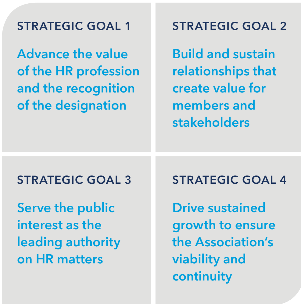
Figure 3 - CPHR BC & Yukon Strategic Goals

Guided by the CPHR BC & Yukon's vision, mission, and core values and upon reflection of the current environment and Association priorities, four strategic goals have been affirmed for the 2016-2017 period.