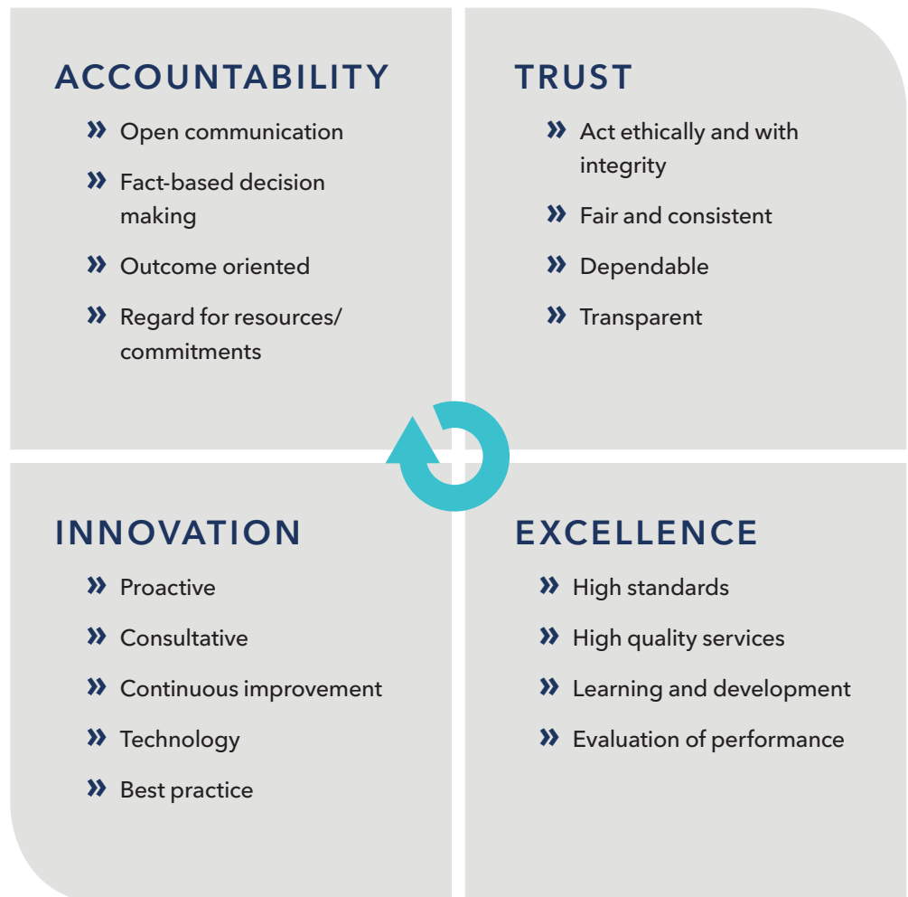
Figure 2 - CPHR BC & Yukon Core Values

The CPHR BC & Yukon's organizational values mould and direct the considerations, decisions, and actions of our Board of Directors and staff. Authentically pursued, these values reflect and shape the culture of our organization.