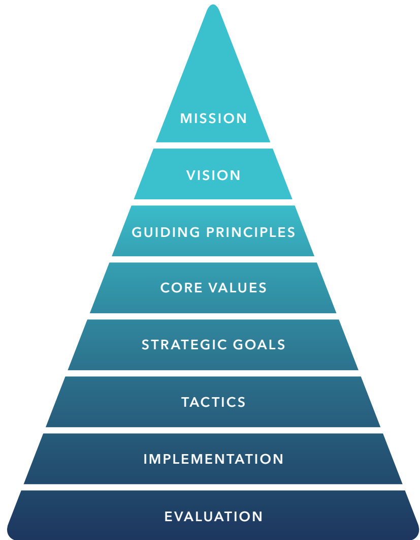
Figure 1 - CPHR BC & Yukon Planning Hierarchy

Building on the accepted Mission, Vision, and Guiding Principles (which have been reproduced in Appendix A), the Association has embarked on the exercise of articulating its Core Values, Strategic Goals, and premeditated Tactics recognizing also that the plan requires enduring support in its implementation and ongoing evaluation and adaptation.