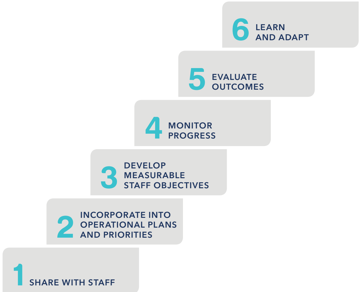
Figure 4 - CPHR BC & Yukon Implementaiton Process

Moving forward, CPHR BC & Yukon has identified six key areas of focus for the term of this strategic plan.